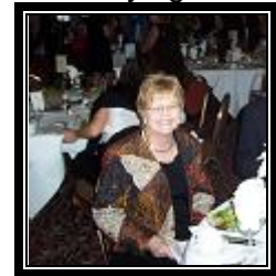
Governor Barbara Roberts