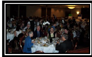
A glimpse of the evening's guests.

The evening's keynote speaker was not a speaker, but a 16 minute video featuring Compassion's staff, board members, clients, family members and highlights from the national news media. The video told the story of our history, our struggles and how our clients and their loved ones feel about Oregon's aid-in-dying law.